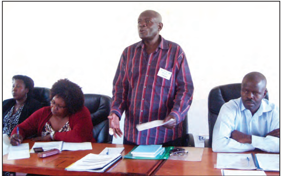
Empowering stakeholders in procurement is a key objective of PPDA

Running over a period of five years, the USAID-GAPP programme is to enable local governments, communities, private sector, and civil society organisations to access and understand the information and data generated by the Office of the Auditor General (OAG) and PPDA audit reports.