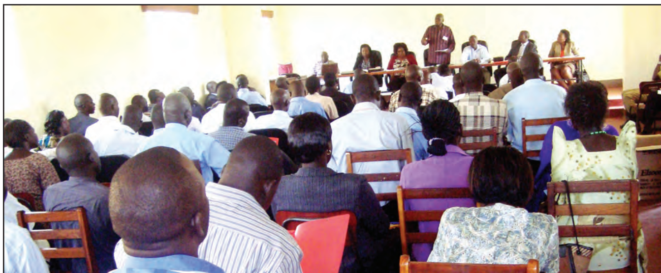
Northern Uganda public servants and leaders have committed themselves to implement PPDA recommendations