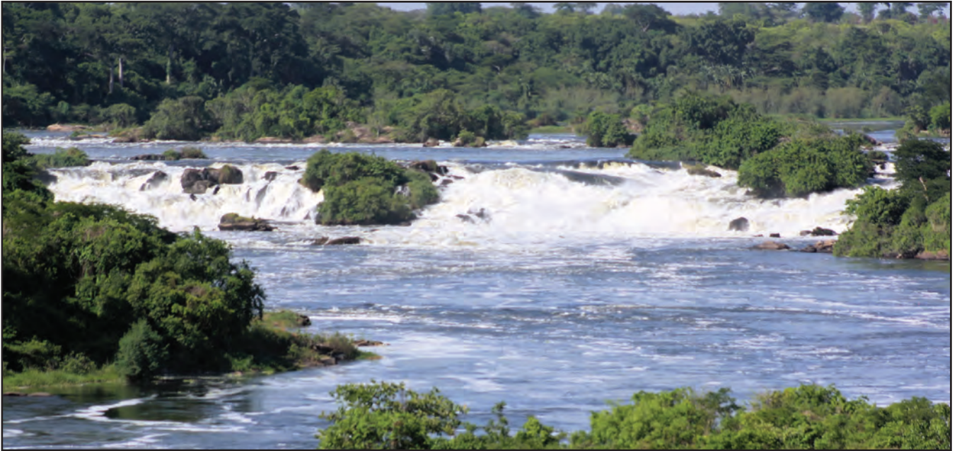
The Karuma Falls in northern Uganda will power the next national hydro project

On 16th November 2012, the High Court issued a ruling in the application for judicial review brought by Salini SpA against the Attorney General and PPDA in the procurement for the EPC Karuma Hydro Power Project.