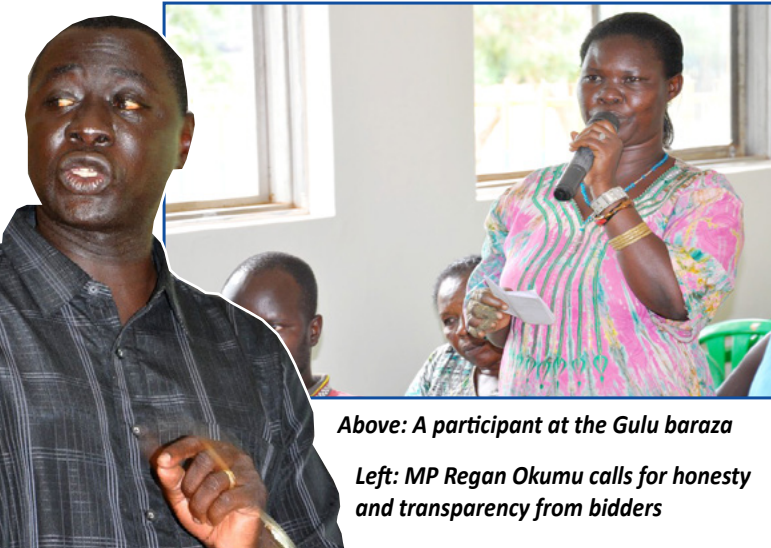
Above: A participant at the Gulu baraza