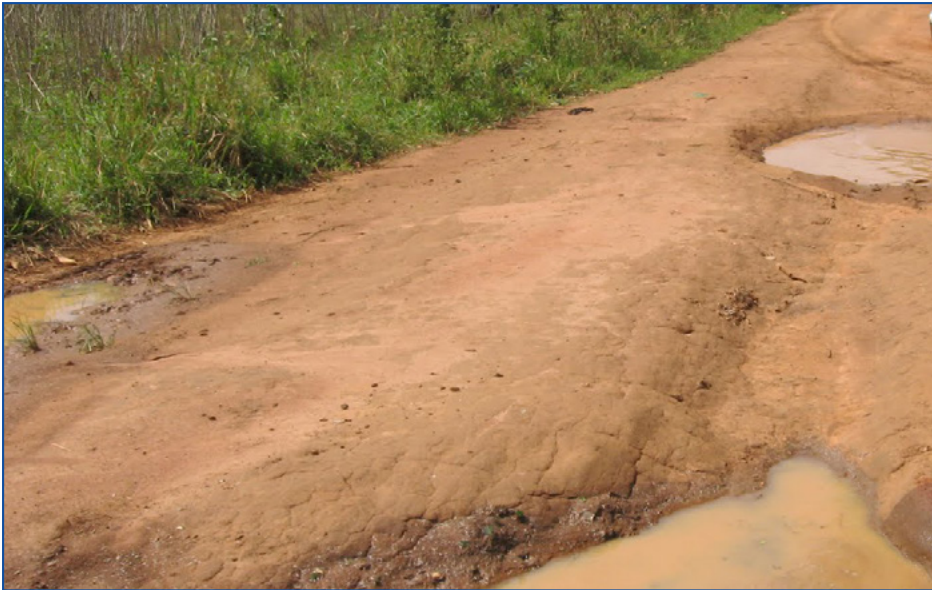
POOR ROADS: Failure to get the right construction firms leads to poor service delivery