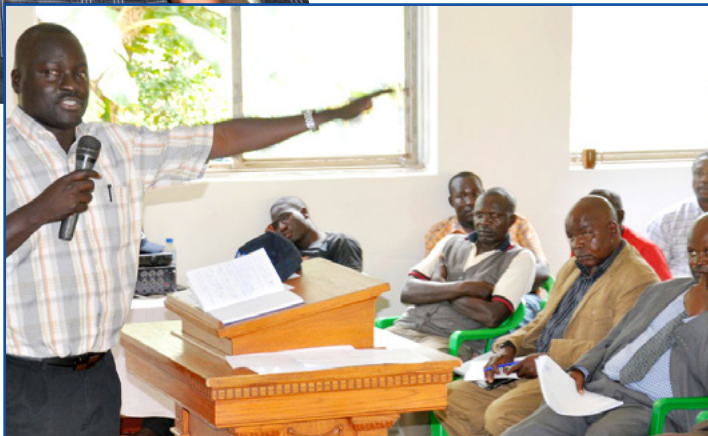
UNRA manager in Gulu responds to queries about regional roads