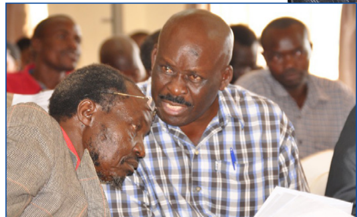
Participants at the Tororo Procurement Baraza consult