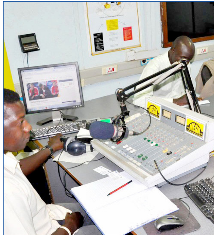
PPDA team in Mega FM studio reaches out to audiences as part of the st