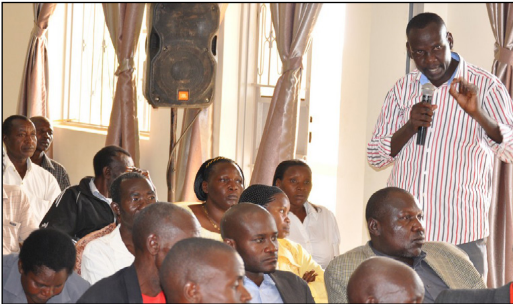
A participant at the Tororo Procurement Baraza shares challenges faced by providers

Barazas in Tororo and Gulu give stakeholders an open voice