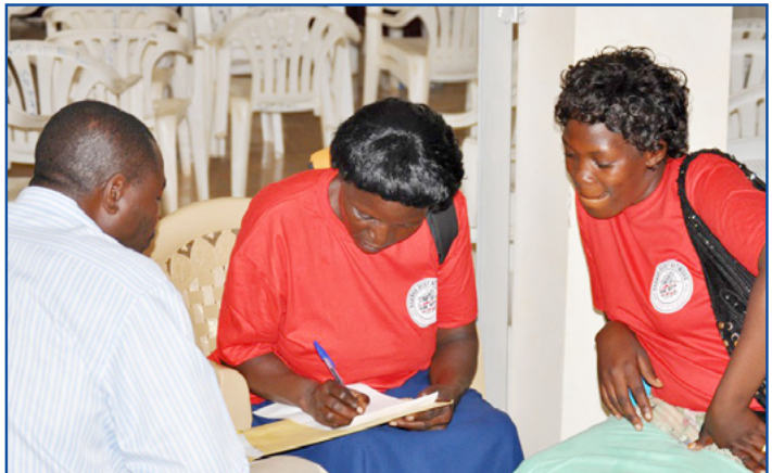
Uganda Debt Network team (red tshirts) engage a participant in