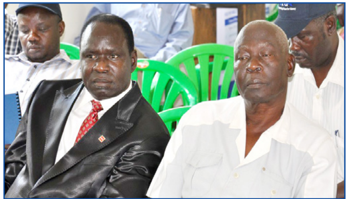
Attentive members of Gulu District Public Accounts Committee