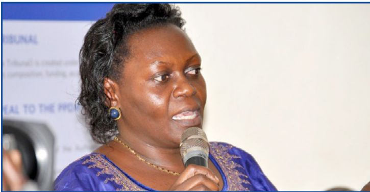
Hon. Sarah Opendi, State Minister for Primary Health, at Tororo Baraza