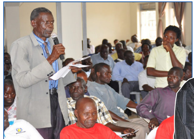
A Tororo elder raises questions on the status of Government projects in his community