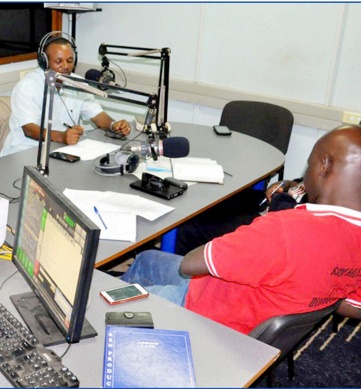
Strategy to empower communities to seek accountability in procurement