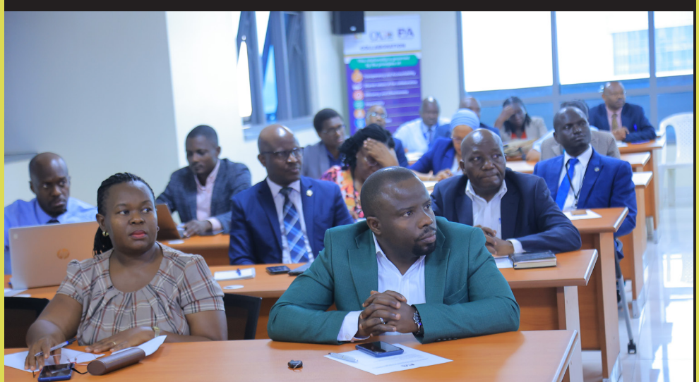
Some of the members of contracts committees and heads of procurement and disposal units of selected government agencies that attended the meeting.

“I was given an assignment to look at how we should stop corruption even if it means amending the law. If we think corruption is at the evaluation committee, we shall remove