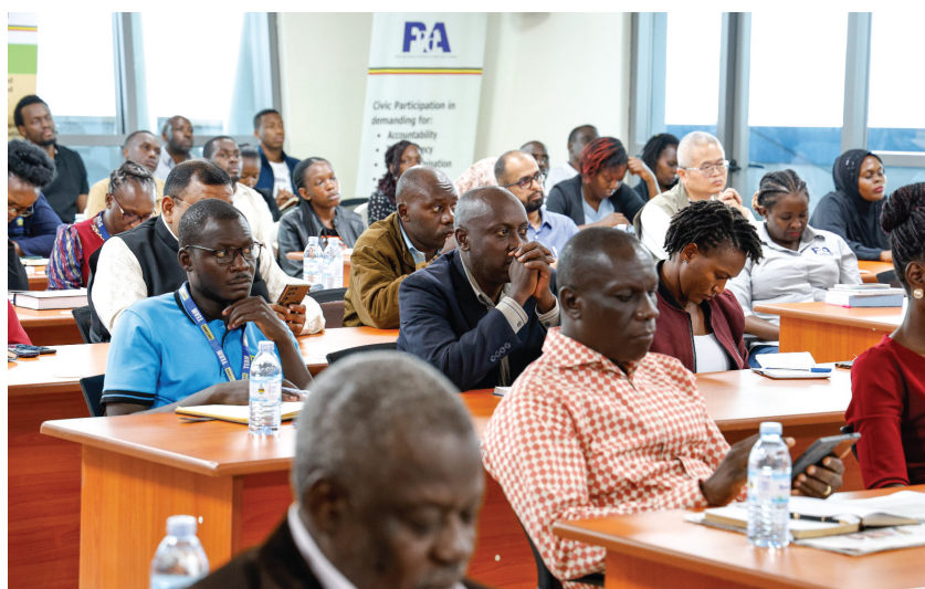
A section of the business community that attended the round-table at the PPDA head office for an engagement on implementation of local content guidelines.

It was against this background the Authority organized a Roundtable about the subject. It brought together, among others, stakeholders from Uganda Manufacturers Association, Uganda National Association of Building and Civil Engineering Contractors, Private sector foundation, Uganda Small Scale Industries Association (USSIA), Uganda Institution of Professional Engi-