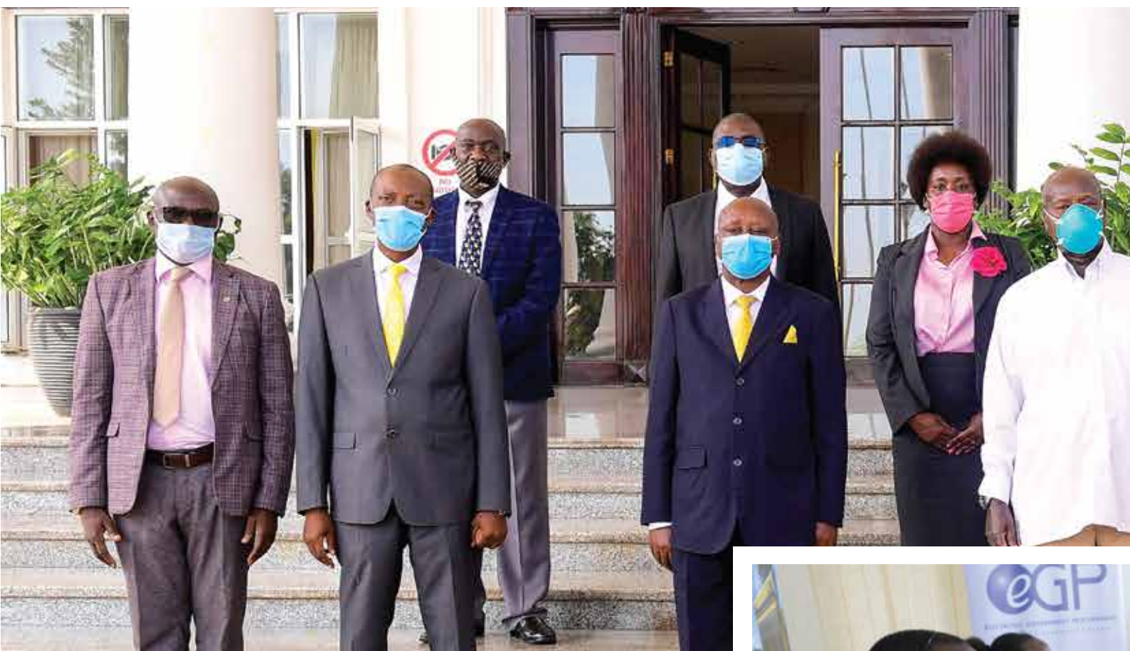
On Wednesday 18/08/2021, members of the Board of Directors and Management of the PPDA met President Yoweri Kaguta Museveni at State House Entebbe. They briefed the President on a range of issues and how PPDA is applying its mandate to ensure that Public Procurement delivers on national development goals. The President expressed appreciation for the significance of Public Procurement in social economic transformation of the country. He urged the team to support to investors, and to ensure that major national infrastructure projects are implemented without undue delays.