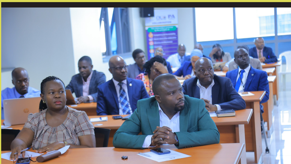
Some of the members of contracts committees and heads of procurement and disposal units of selected government agencies that attended the meeting.

“I was given an assignment to look at how we should stop