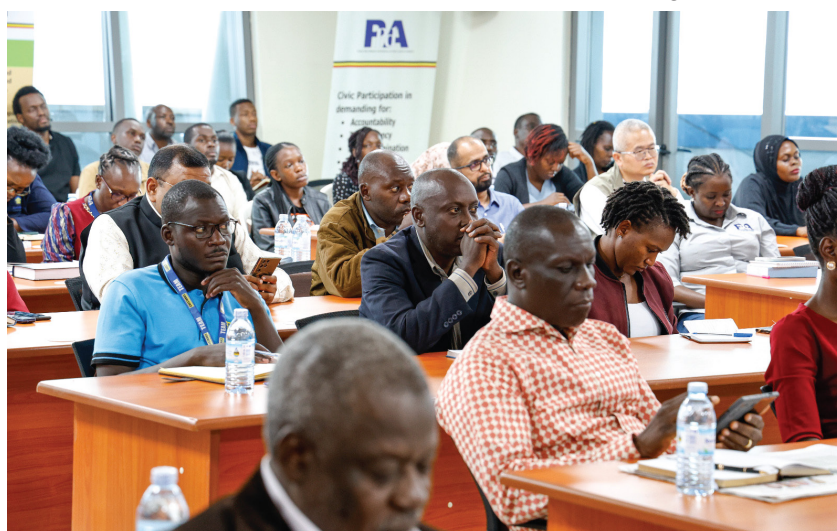
A section of the business community that attended the round-table at the PPDA head office for an engagement on implementation of local content guidelines.

It was against this background the Authority organized a Roundtable about the subject. It brought together, among others, stakeholders from Uganda Manufacturers Association, Uganda National Association of Building and Civil Engineering Contractors, Private sector foundation, Uganda Small Scale