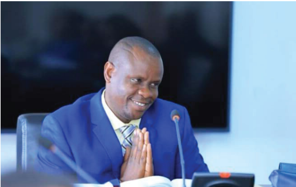
The Minister of State for Youth and Children Affairs, Balaam Barugahara Ateenyi

The state minister for Youth and Children Affairs, Balaam Barugahara, has challenged the youth to form associations so as to benefit from public procurement opportunities created by government.