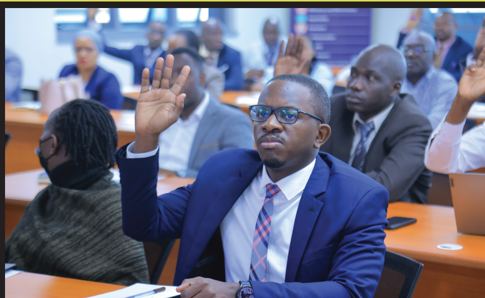
Participants in the meeting enumerated the challenges encountered in implementing the schemes because of conditions in some development partner funded projects, owing to financing agreements not allowing preference and reservation schemes.

“Financing agreements do not allow preference and reservation