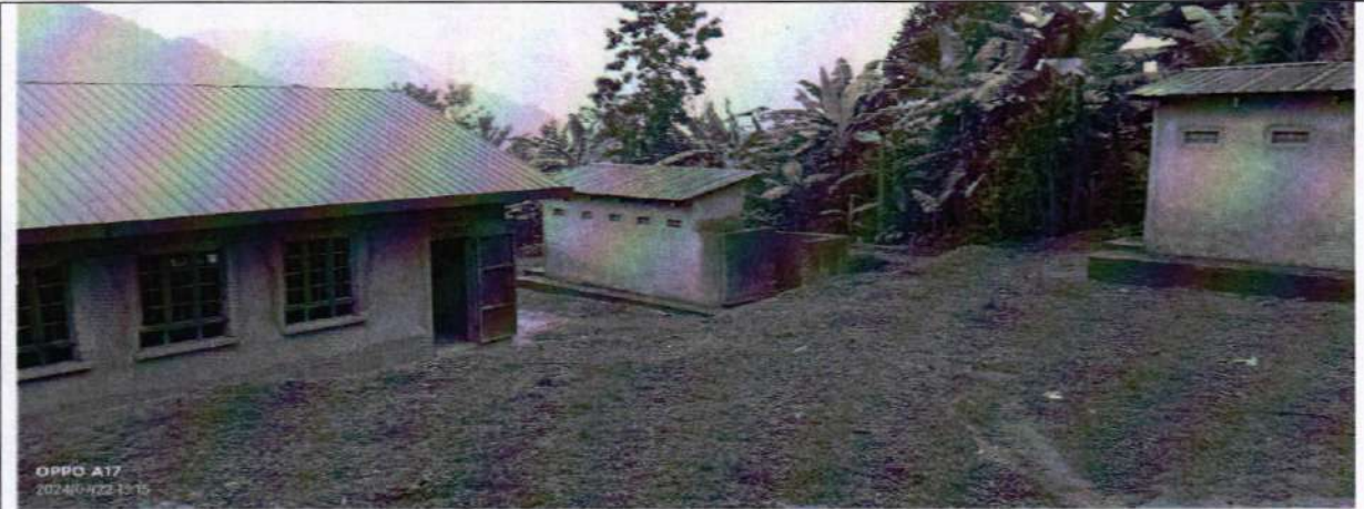
The 5 Stances lined latrines for both Boys and Girls