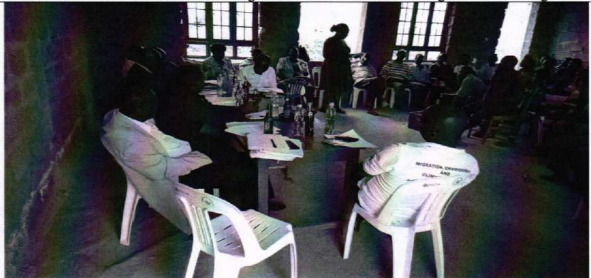
Site meeting held on 19 th January 2024