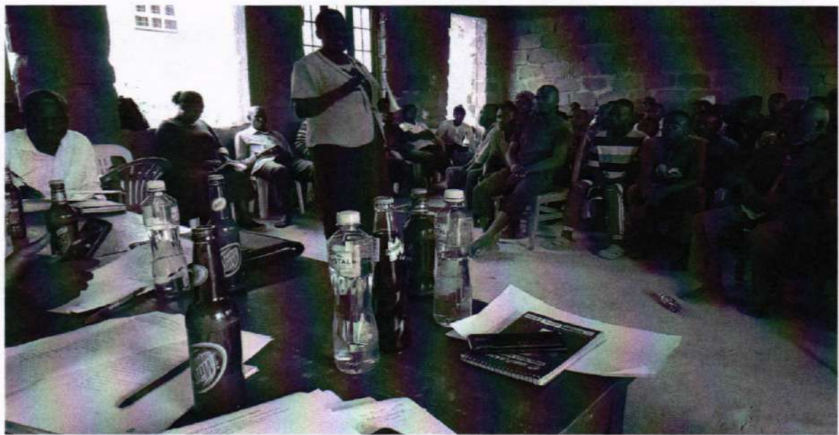
District Community Development Officer sensitizing the stakeholder on site safety and health.