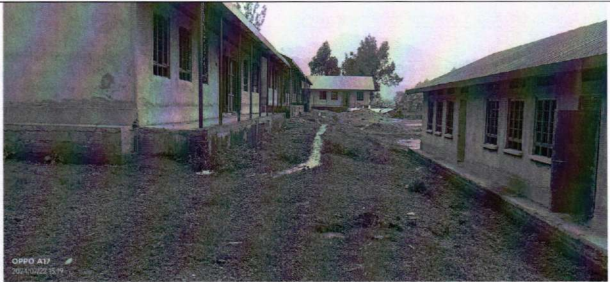
Administration Block in the foreground with 3no 2 classroom blocks on the LHS and Multipurpose Hall on the Right Hand Side