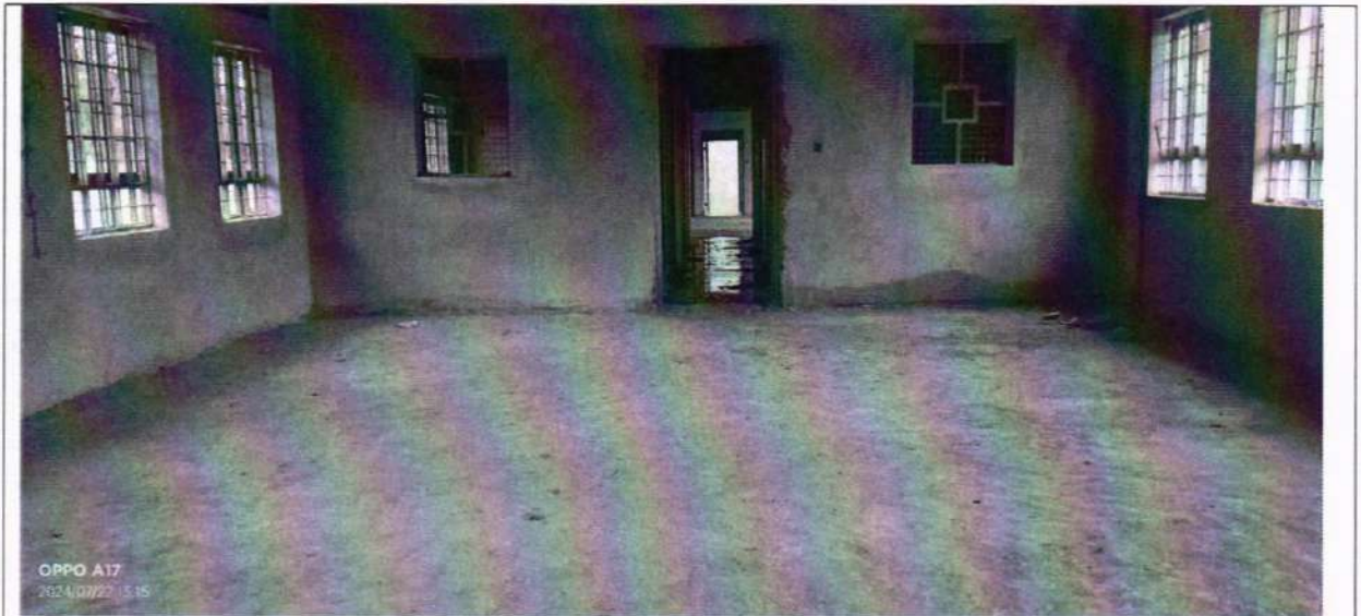
Library and ICT Block at finishes internally