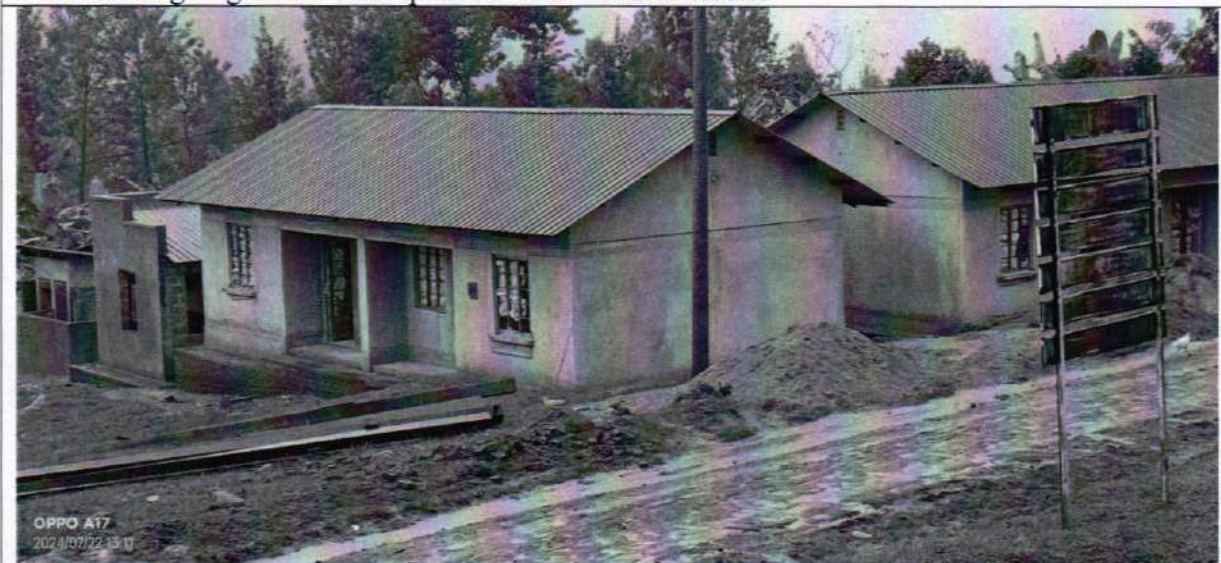
Current State of the Teachers Quarters