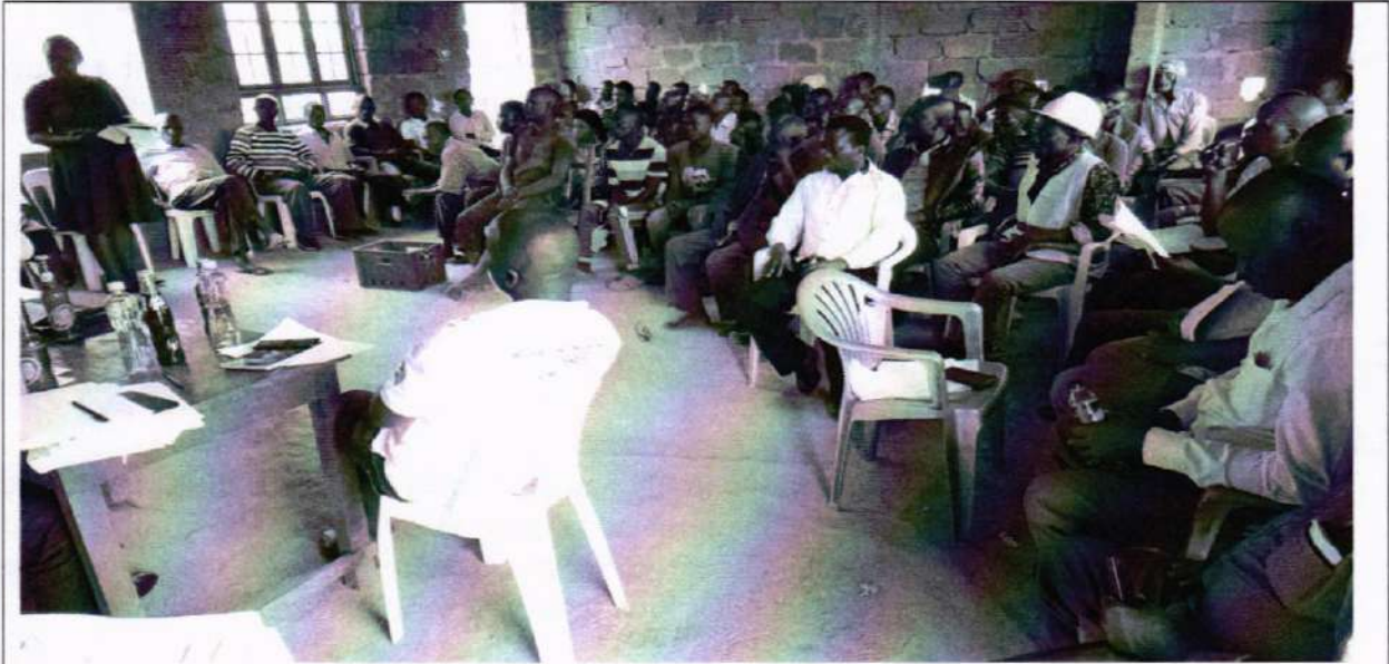
District Environment Officer addressing matters of environment during the site meeting