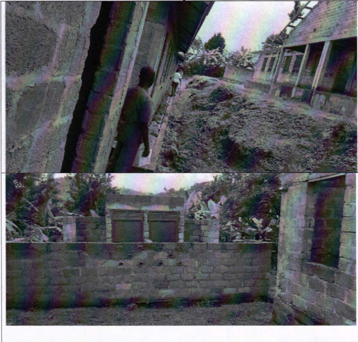
Table 5: Status of works at the site as at 19 th April 2024

Table 5 below contains pictures showing the physical progress of the project as per the findings of the physical verification exercise that was conducted by the Authority on 19 th April 2024.