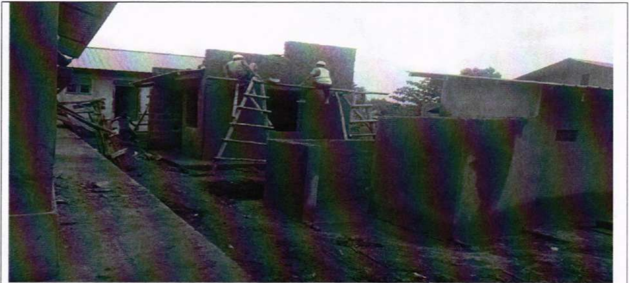
Finishes on going on the staff quarters with workers on site