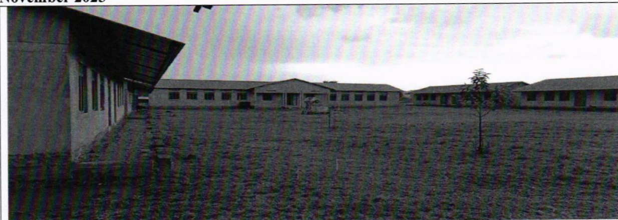
Image 7: 360 view of Kibuuku Seed School abandoned at the roofing stage as of 26 th November 2025