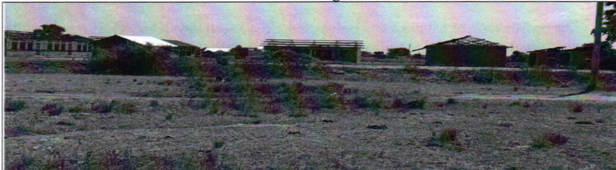
Image 2: shows the overall viewed of the abandoned project with structures at the roofing stage

Annex 1: shows the status of the works at Butungama Seed School as of 26 th November 2025