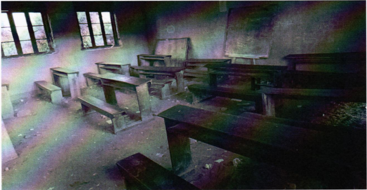
Image 1: Shows one of the structures used as a classroom at Kibuuku Seed Secondary School construction site

Clause 24 of the General Conditions of the Contract gave full responsibility to the Contractor for the safety of all activities and personnel on site before project hand over. The Authority found that due to the dire need for secondary education facilities within the district, the incomplete structures for Kibuuku Seed Secondary School have been put to use before clearance of their safety for use in form of an occupational permit and completion of the project. Image 8 below shows one of the structures being used as a classroom as of 26 th November 2025.