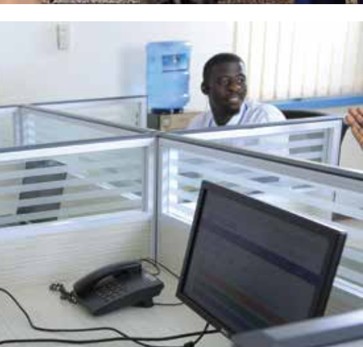
The government is rolling out the electronic government procurement system also known as the e-GP. The e-GP is to create efficiency and transparency in the public procurement system. Our officers are always on standby to help providers through the e-GP registration process