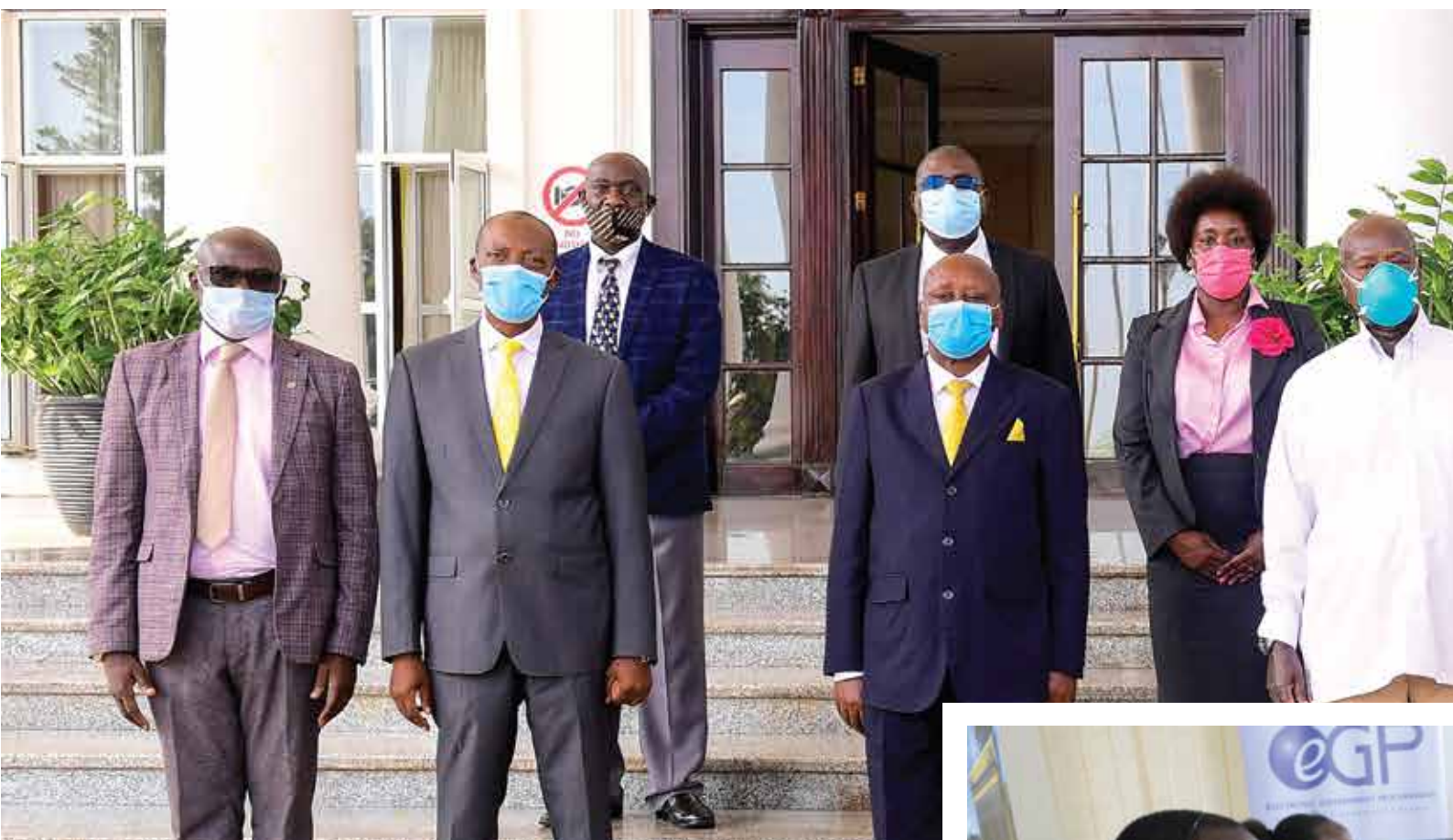
On Wednesday 18/08/2021, members of the Board of Directors and Management of the PPDA met President Yoweri Kaguta Museveni at State House Entebbe. They briefed the President on a range of issues and how PPDA is applying its mandate to ensure that Public Procurement delivers on national development goals. The President expressed appreciation for the significance of Public Procurement in social economic transformation of the country. He urged the team to support to investors, and to ensure that major national infrastructure projects are implemented without undue delays.