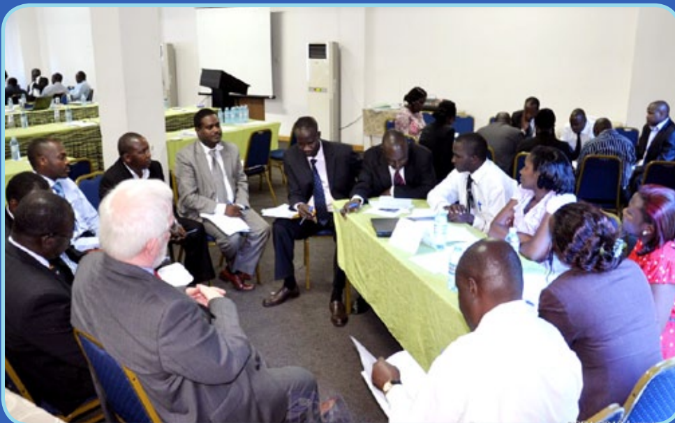
Participants engaged in a discussion at a contracts management workshop in Kampala

The Workshop reviews findings and report on contract management in Uganda public sector (Workshop reviews public sector contract management) On December 12th 2012, the Public Procurement & Disposal of Public Assets Authority (PPDA)