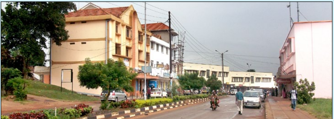
Municipalities like Entebbe could benefit from the development funding under the World Bank programme

The size of contracts will vary in size from approximately US$ 0.1 million to US$2 million depending on the funds the MC receives and the number of projects it prioritizes. MCs will be encouraged to have fewer lumpy investments rather than to split the funds into various small sub projects.