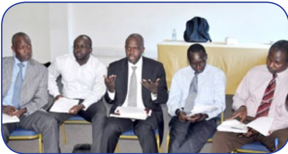
Working with other entities to achieve our goals