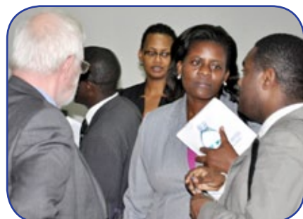
PPDA with the support of the World Bank consultants to undertake a review of contract management in Uganda's Public Sector. The consultant, left, after presenting findings of the survey