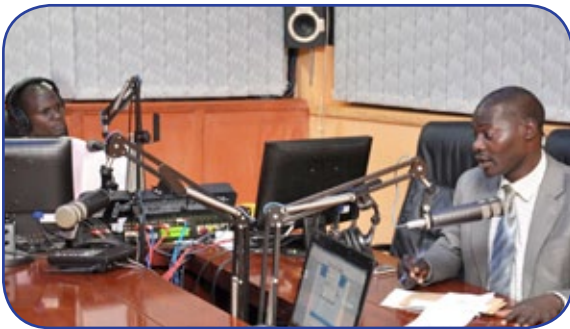
Different media are used to reach our stakeholders, here at Baba FM, PPDA engages providers and the public