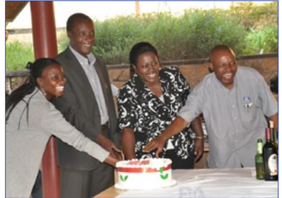
Executive Director and staff at end year get-together