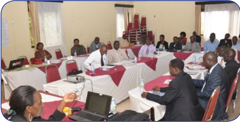
Contracts Committees members training in Jinja